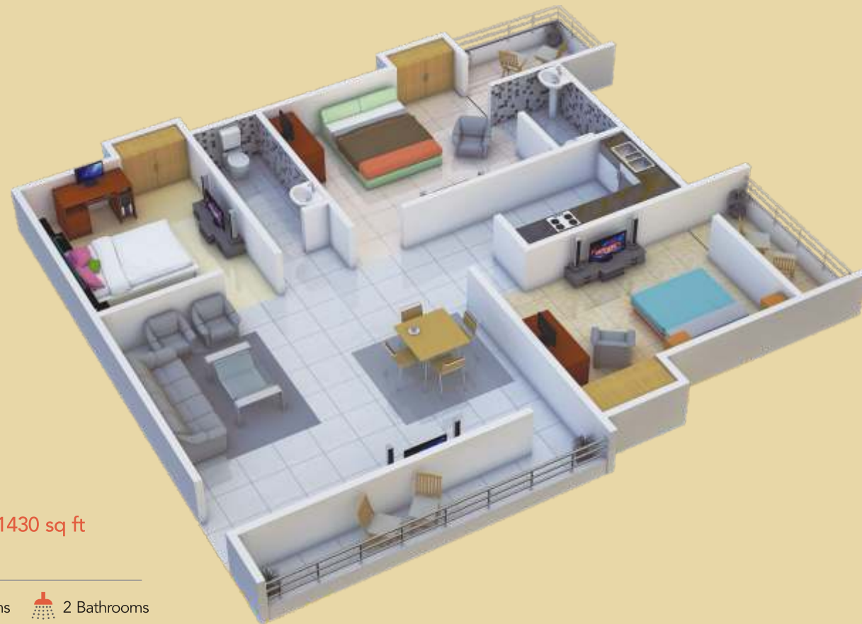
3 BHK + 2T 1430 sq ft Flat # 6