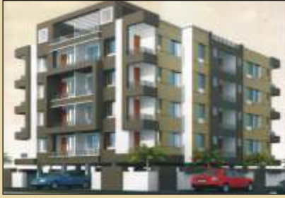
Rajkamal Palace Ramjaipal Nagar, Patna