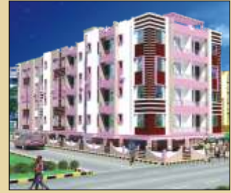
Amar Ajay Enclave Bailey Road, Patna