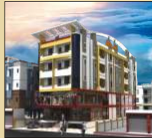
Sidheshwar Palace Mill Road, Nawada, Ara