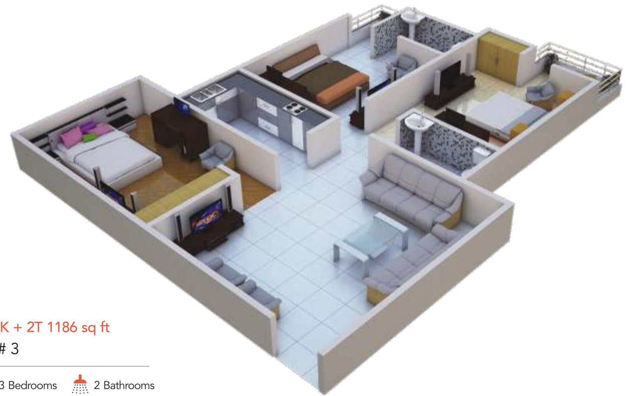
3 BHK + 2T 1186 sq ft Flat # 3