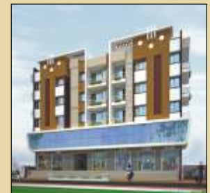
Rajkamal Plaza 2 Jaiprakash Nagar, Dhanbad