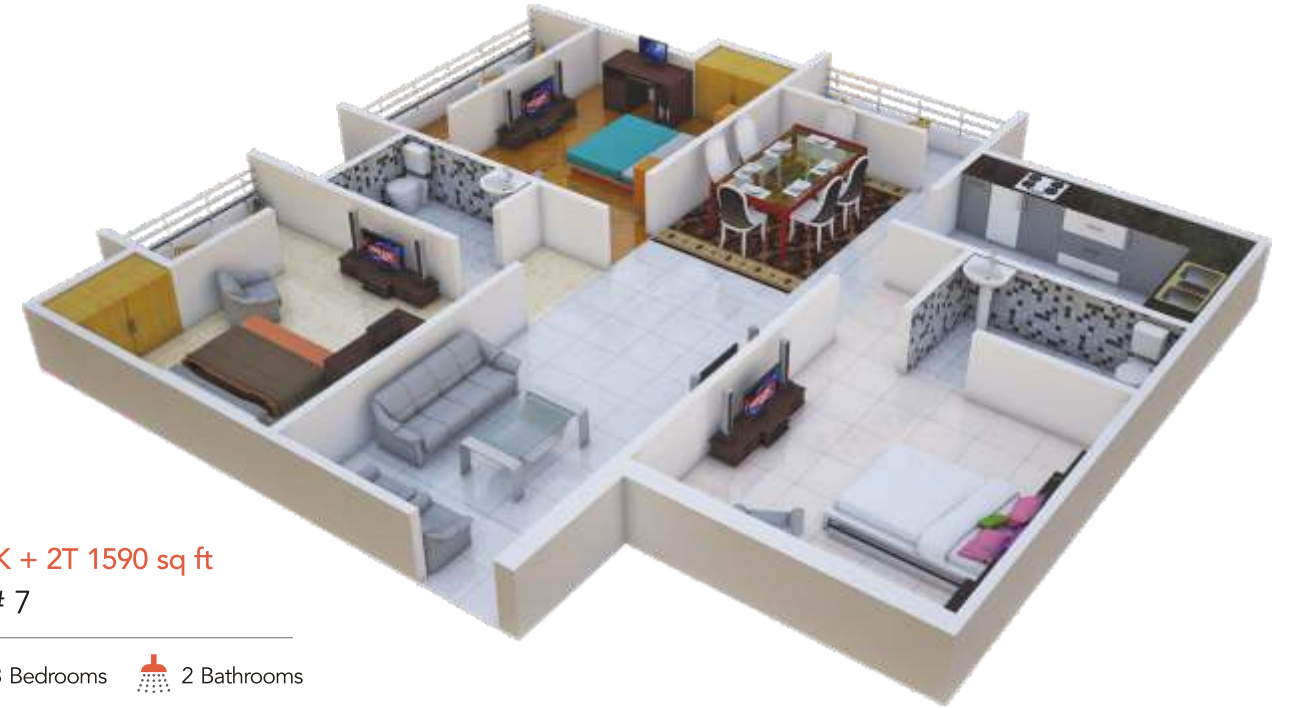
3 BHK + 2T 1590 sq ft Flat # 7