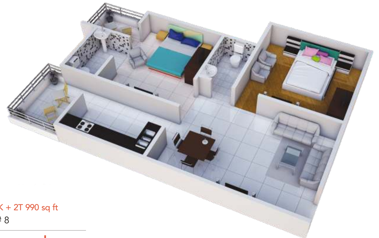
2 BHK + 2T 990 sq ft Flat # 8