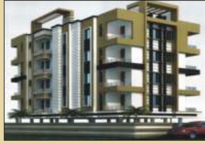
Raj Suman Palace Ramjaipal Nagar, Patna