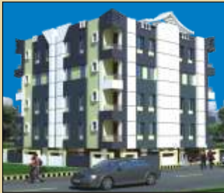
Bhawani Palace Ramna Maidan, Ara