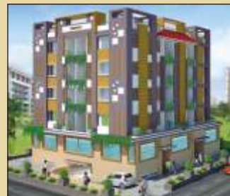
Rajkamal Plaza Jaiprakash Nagar, Dhanbad