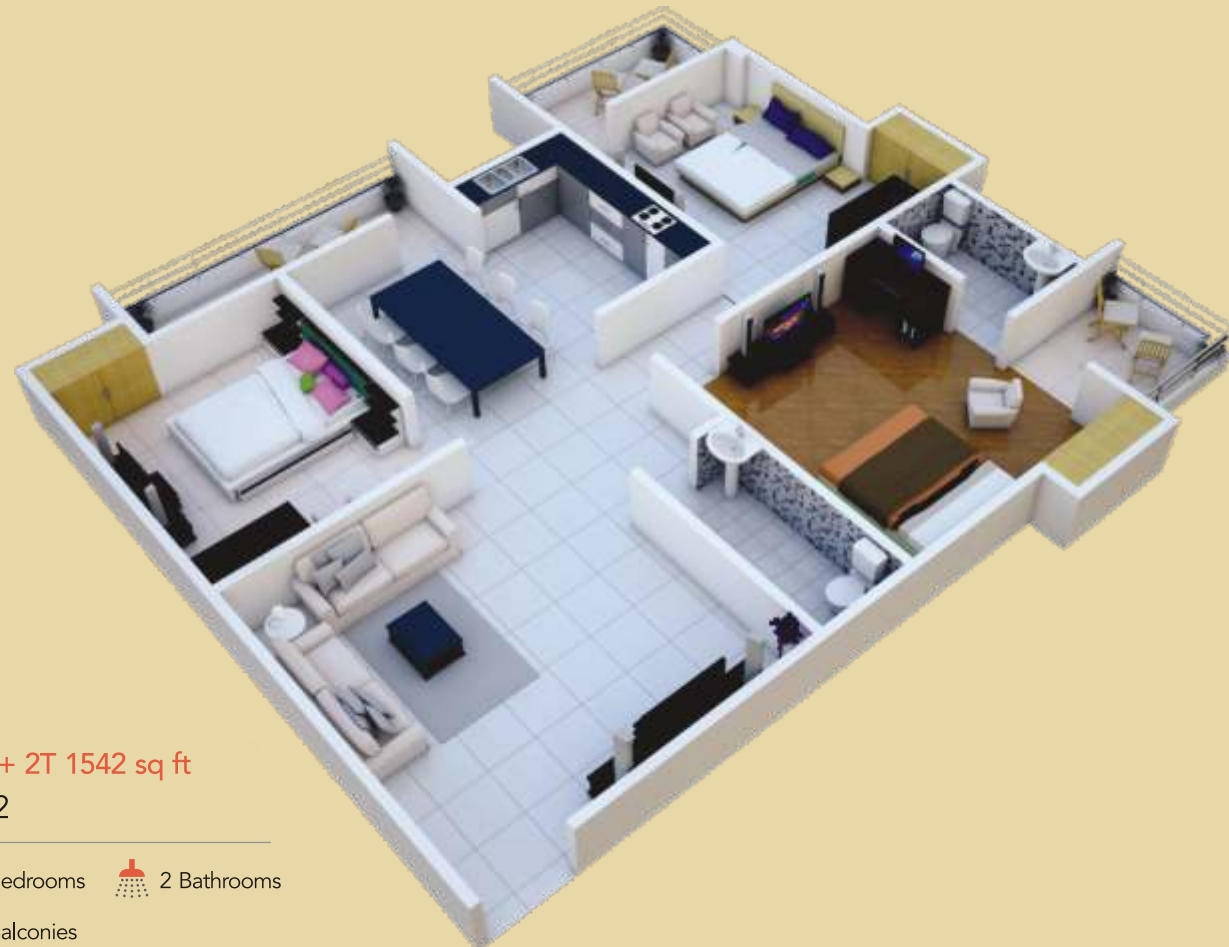
3 BHK + 2T 1542 sq ft Flat # 2