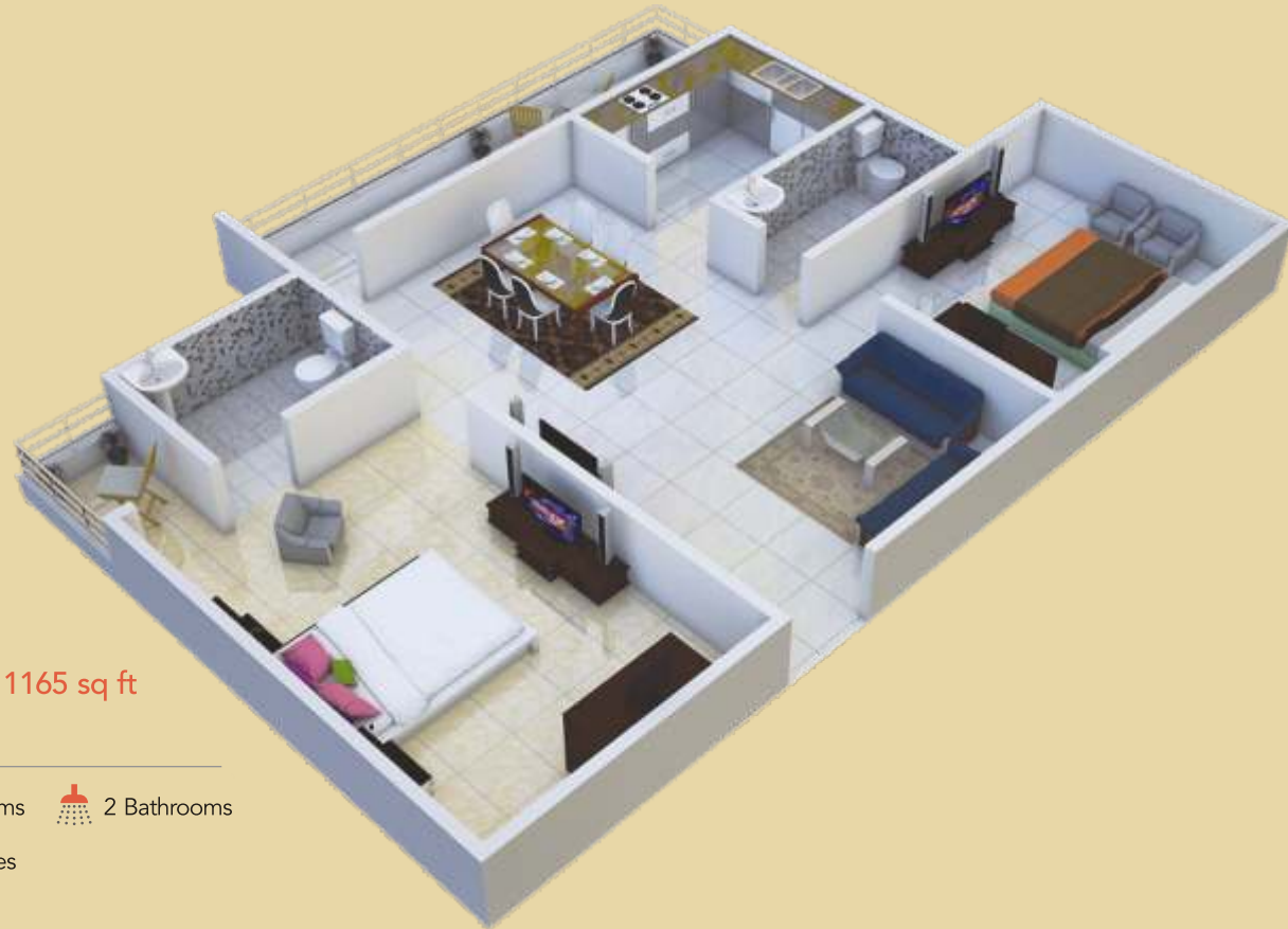
2 BHK + 2T 1165 sq ft Flat # 5