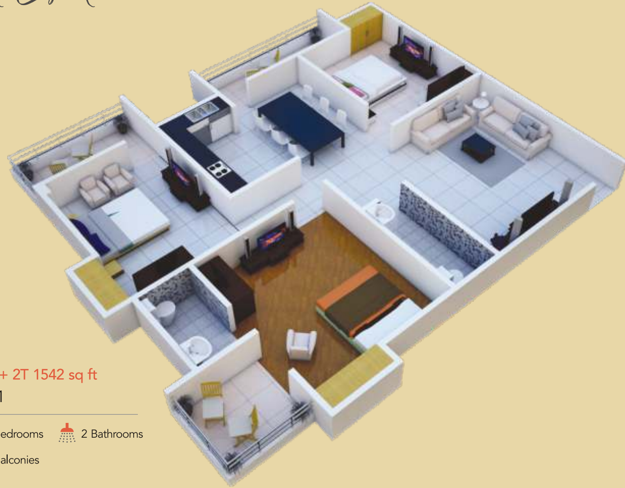
3 BHK + 2T 1542 sq ft Flat # 1