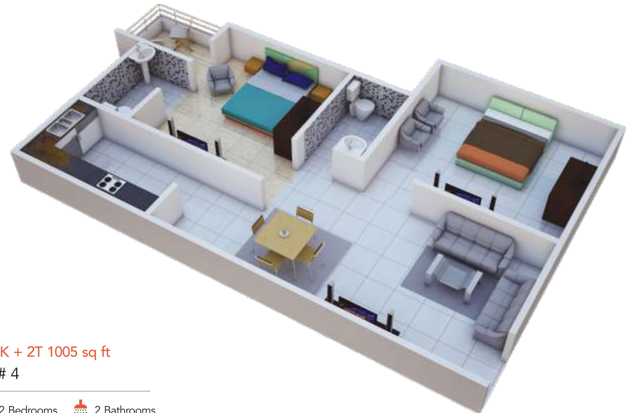
2 BHK + 2T 1005 sq ft Flat # 4